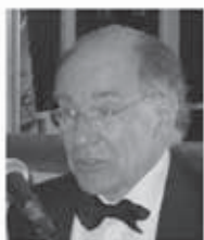
Author and Medalist Edward Rutherford

Larger-than-life historical characters fill the background: Stuyvesant, the Dutch Director