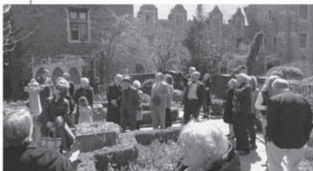
The group visited the biblical herb garden