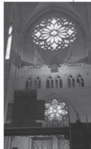
St. John central portal window