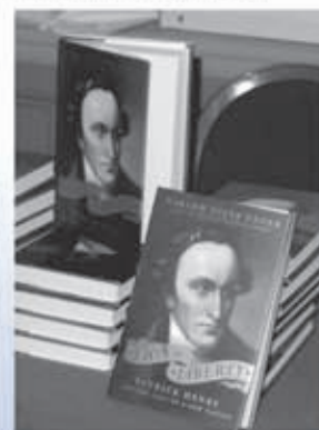
Copies of Lion of Liberty sold briskly