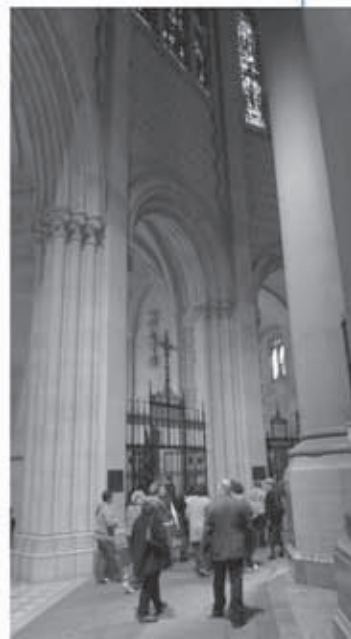
Members tour the Ambulatory

From the cathedral the group walked over to the French-style mansion that formerly served as the residence of the bishops of New York, stopping at the biblical herb garden, where every plant mentioned in the Bible grows, though little was in bloom at this time. At Cathedral House a simple lunch was served, and followed by the traditional egg-cracking ceremony, bringing the day to a joyous conclusion.