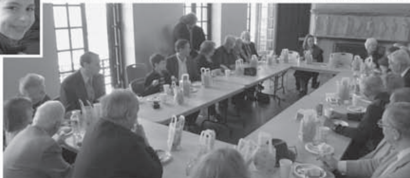
Lunch in the former Bishop's House, now Cathedral House