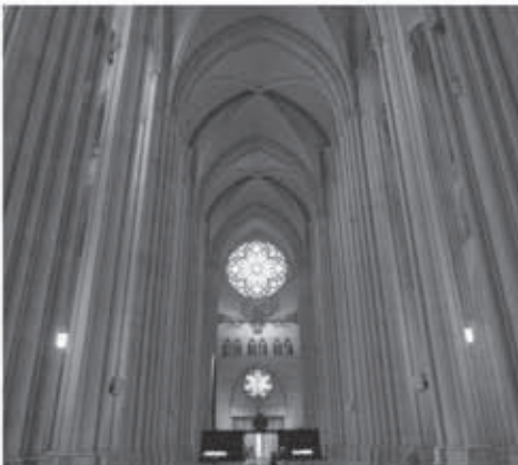
Nave of the Cathedral of St. John the Divine looking west

Liverpool Cathedral in England and St. John the Divine both claim to be the largest cathedral and Anglican church. The inside covers 121,000 sq. ft., spanning a length of 601 ft. and height of 232 ft. The inside height of the nave is 124 ft. It is the longest Gothic nave in the United States. The building was designed in 1888, and construction began in 1892. While the nave has been completed, the cathedral is far from finished. Nonetheless, it is a massively impressive achievement—all the more so since undergoing a thorough cleaning and restoration in the wake of a serious fire that damaged the interior in December 2001.