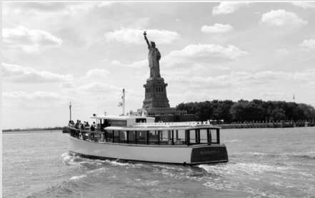
Members enjoyed an architectural tour from both the Hudson and East rivers aboard the yacht 'Manhattan.'