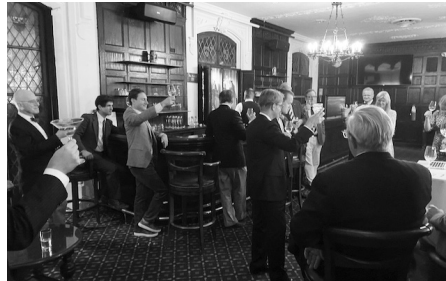
First in-person 2020 event

WELCOME BACK RECEPTION WITH THE SOCIETY OF COLONIAL WARS IN NEW YORK, SEPTEMBER 24, 2020, WESTCHESTER COUNTRY CLUB